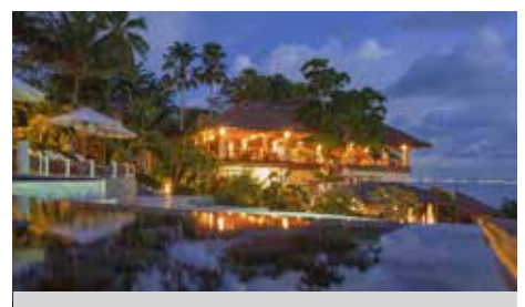
BUNAKEN OASIS DIVE RESORT & SPA

Murex Bangka is situated on a palm-fringed, white sand beach offering a tropical escape in stunning remoteness of a paradise island. With an exotic charm that runs throughout the resort, rooms are tastefully appointed to provide spectacular views over the ocean. The beachfront restaurant has an open-air terrace for dining al fresco and first-rate diving facilities for excellent underwater adventure.