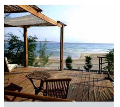
BAIA SONAMBULA GUEST HOUSE

Mozambique is a gem for divers who love megafauna. Tofo, located in southeastern Mozambique, is famed for its stunning, curved, golden beach; however for us divers, it is more notable for its plankton-rich waters brimming with biodiversity, attracting whale sharks, giant manta rays and dolpins all year round, with seasonal sightings of migrating humpback whale sightings during the winter months. Aside from these gentle giants, Tofo is home to pristine reefs, two impressive manta ray cleaning stations, pinnacles, caves and an abundance of beautiful marine life. In southern Mozambique, Ponta do Oura is a small coastal town primarily famed for its upclose encounters with apex predators - tiger sharks, hammerheads, bull sharks, silver tips and black tip sharks - all are year-round frequent visitors to these warm, clear and vibrant waters. Diving in Mozambique is seasonal, with most divers visiting between October through to April. During July & August, you are very likely to see many migrating humpbacks. Diving generally takes place in the mornings, however when weather permits, an afternoon dive is sometimes possible. There are no ports in Mozambique, tractors are used to push RIBs into the water, then once afloat, everyone hops in and holds on as you head through the surf zone.... even the launches are exciting!