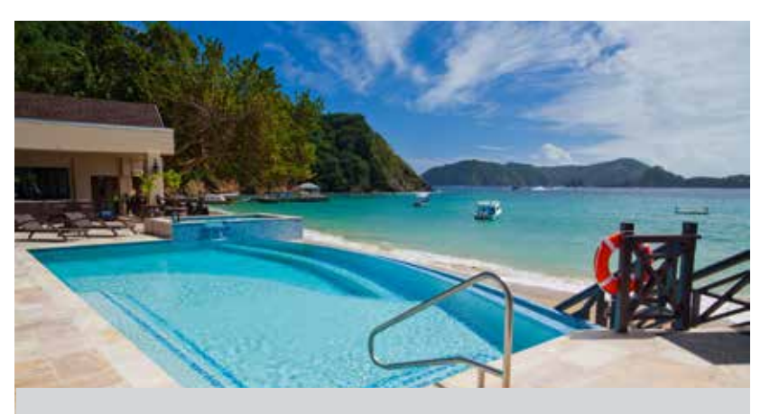
BLUE WATERS INN