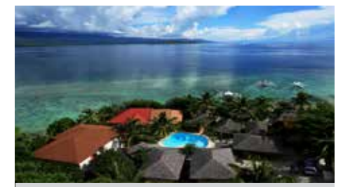
MAGIC ISLAND DIVE RESORT

Malapascua Exotic Island Dive Resort is a beautiful retreat on a sought-after stretch of Bounty Beach. Triumphing as the pioneers of thresher shark diving in Malapascua, you are guaranteed some of the best shark diving in the Philippines with the incredible knowledge and expertise of the team. With magnificient sea views and a highly-acclaimed restaurant, your stay here will not disappoint.